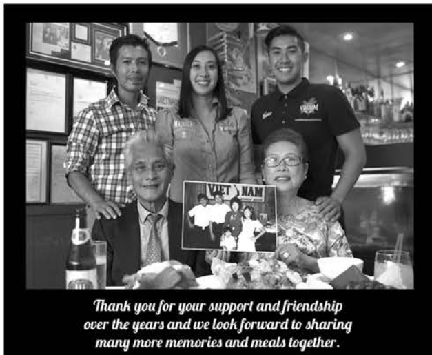
Thank you for your support and friendship over the years and we look forward to sharing many more memories and meals together.

Phone Orders on 8447 3395 Fax: 8241 0473